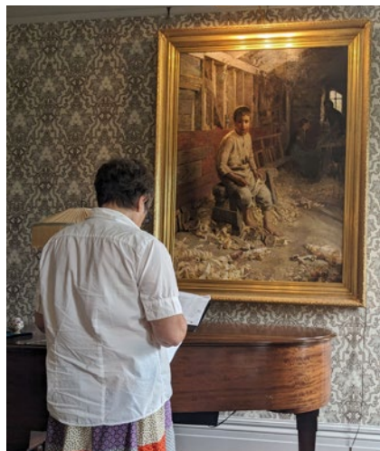
Conducting inventory of The Carpenter's Son , in the rear parlor of the museum.