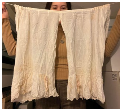
One of many, many bloomers.

Over the last few weeks I've been sorting through our extensive collection of antique textiles, updating our catalog records with detailed condition reports on all of these delicate items. It's difficult to choose a favorite piece amongst all the extravagance—smooth silk taffeta, floral embroidery, and scalloped lace trims—but I am partial