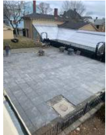
Left: New iron railings lead to the parterre rose garden. Right: New bluestone replaces mismatched, broken patio stones.